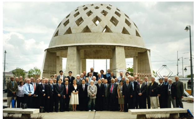
CAETS meeting, Budapest, June 2013