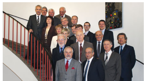
Board May 2013

Members of the Executive Committee are ex officio members of the Board. During 2013, members of the Executive Committee met three times, and held two telephone conferences. The Board met twice, on May 16, in Munich (including a workshop on the future strategy of Euro-CASE), and on December 11, in Lisbon, after the Annual Conference.