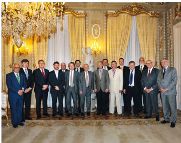
Innovation Platform, Madrid meeting, June 6, 2013