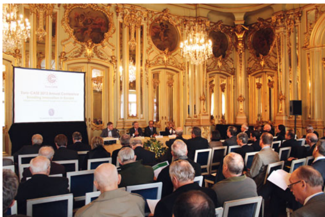
Euro-CASE Annual Conference 2013, Palácio Foz, Lisbon