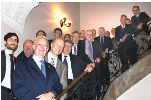
Energy Platform, Brussels meeting, Oct. 1-2, 2013

During the kick-off event that was honoured by the presence of the Director General of the Joint Research Centre, Dominique Ristori (now Director General of DG Energy), the Platform agreed that the EU was the key to a viable implementation of a transition to sustainable energy supply in its Member States. A revived EU-ETS and market based and harmonised support schemes throughout Europe were important aspects of a EU-wide energy turnaround.