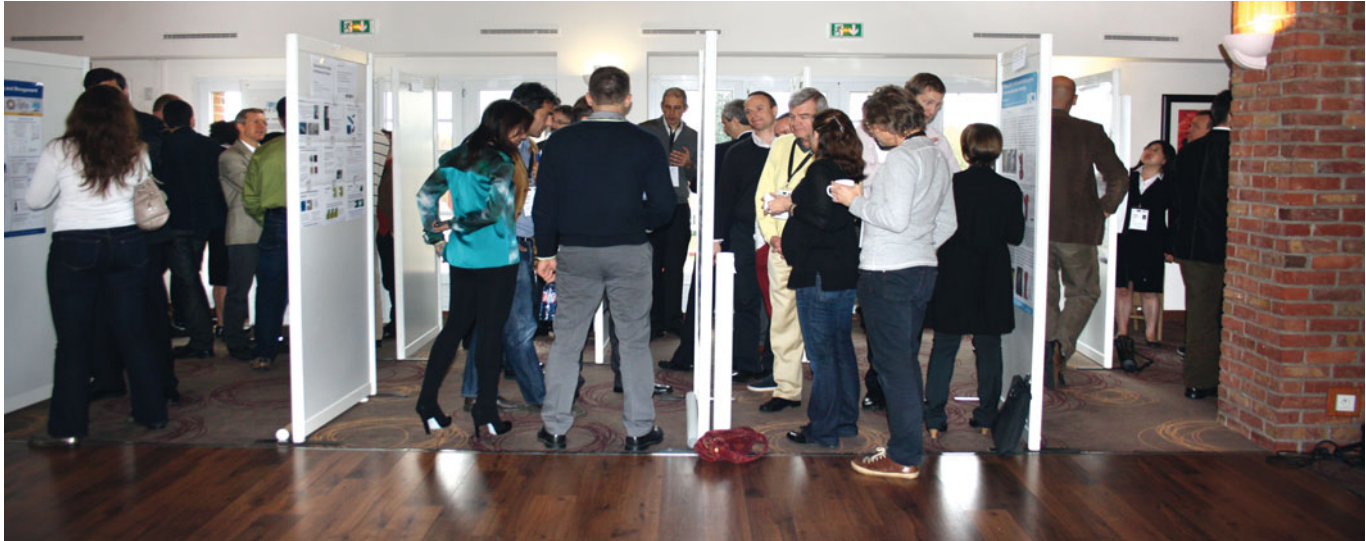
Poster Session FOE Symposium